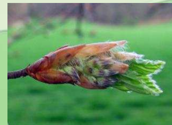
Fagus sylvatica - Beech